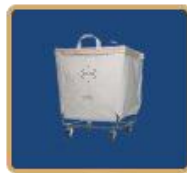
Linen & Laundry