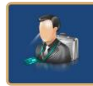
HR and Payroll